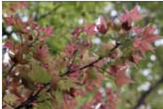
Sweet Gum – Leaves with scent of _____