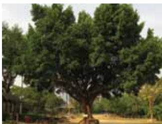
Chinese Banyan – Processes _____ to facilitate breathing.