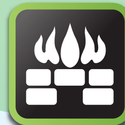
只可在指定燒烤或 露營地點生火 Use fire only in designated barbecue sites or camp sites

以上所列並非盡錄郊野公園及特別地區內受管制的活動。有關詳情，請參閱香港法例第208A章《郊野公園及特別地區規例》、第170章《野生動物保護條例》和第96章《林區及郊區條例》。