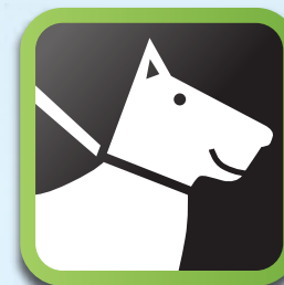
妥善控制你的狗隻 Control your dog