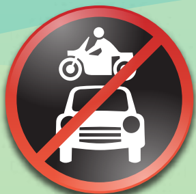
未經許可，切勿駕駛 車輛進入郊野公園 Don't drive your vehicle into country parks without a permit