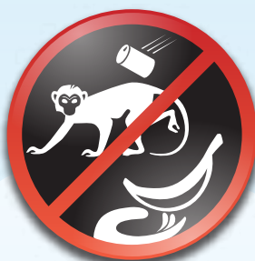
切勿狩獵，傷害或餵飼 任何野生動物 Don't hunt, hurt or feed any wild animal