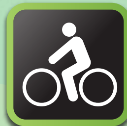
只可在指定的越野單車徑 或地點踏單車 Ride bicycle only in designated mountain bike trails and sites