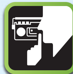
盡量降低聲量 Keep the voice down