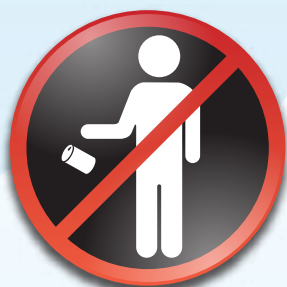
切勿亂拋垃圾 Don't litter

When visiting country parks and special areas, members of the public should observe the Country Parks and Special Areas Regulations and other relevant legislation for protecting wildlife and environment. Offenders are subject to prosecution. In particular, please pay attention to the following: