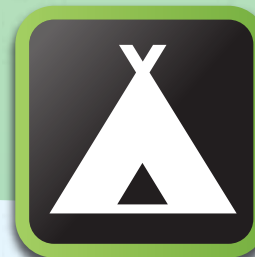
只可在指定露營地點 露營或建立帳幕 Camp or erect a tent only in designated camp sites