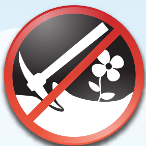
切勿損害任何植物 或擾亂土壤 Don't damage any plant or disturb soil