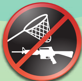
禁止攜帶任何獵捕 或陷阱類器具或槍械 Don't carry any hunting or trapping appliance or arms