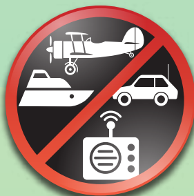
切勿操縱任何動力驅動的模型 飛機、模型車輛或模型船 Don't operate any power driven model aeroplane, model vehicle or model boat