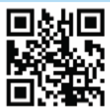
郊野公園越野單車徑或地點 Country Parks Designated Mountain Bike Trails and Sites